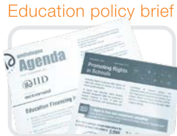
Education policy brief