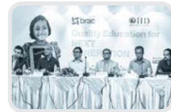
BRAC IID education advocacy campaign 2015