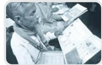
Townhall meeting for sharing citizen report on education