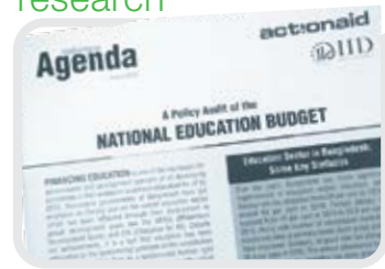
Policy audit on national education budget