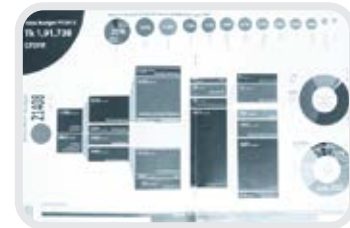
Visual analysis of annual education budget