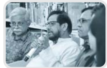
IID as the policy partner for the Libraries Unlimited initiative of British Council and Ministry of Cultural Affairs