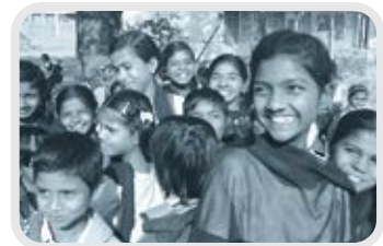
Assesses and evaluates government and non-government education programs