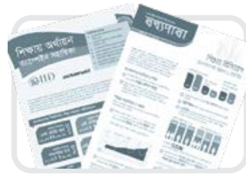
One pagers and toolkits for advocacy for education