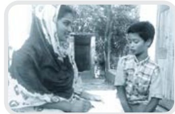
Assessment of children's basic learning competencies